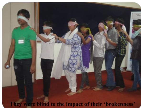
They were blind to the impact of their 'brokenness'

Every time the ARK Team of animators face the challenges of VOC participants. The first task is to establish the magnitude of the vulnerability and the residual effect of the traumatic experiences that children have gone through. The administration of the vulnerability index gives insights into the magnitude of the trauma. The severity of some of traumatic experiences is very high. In other cases though the severity is of low nature, the frequency exacerbates the consequences of trauma on the children.