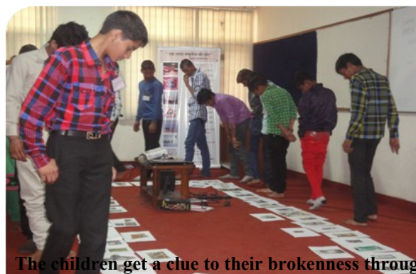
The children get a clue to their brokenness through these photos

Based on the symptoms shown by the children as they open up and share their negative experiences with the animators, the animators are able to gauge the effect and help them disassociate the negative ideas connected with entities involved. Once they are able to do so, then the animator takes them along to deal with the real problem. But what is important in this process is, their knowledge about the residue and the real cause for it then the accompaniment makes sense.