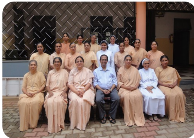
Apostolic Carmelite sisters are eager to define their AC School culture.

There are burning flames of unmet needs and negativity inside most people. That's why they are restless and anybody who comes in contact with them is upset.