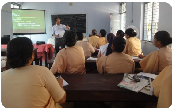
Rise once again to be "Leader-Schools" in education

The Congregation of the Apostolic Carmelite Sisters had won the 'good name' of quality educators. The leading educators and principals of the province of Calicut, in Kerala came together for two days with