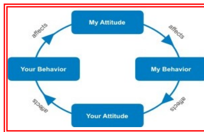
The Betari Box

The Betari Box is a model that helps us to understand the impact that our own attitudes and behaviors have on the attitudes and behaviors of the people around us.